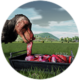
BASIC ANIMAL CARE